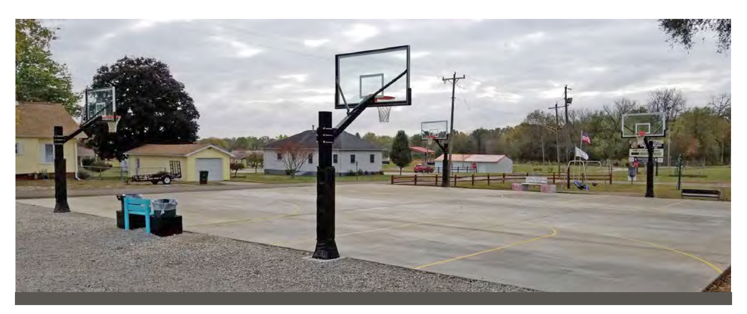
City of Clinton - $2,000 to assist with the upgrades to the basketball court at Sportland Park

North Vermillion High School - $1,000 to provide funding for materials, t-shirts, and food for junior and senior high school students who participate in the statewide Academic Super Bowl Competition